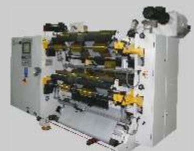
Model for HSF