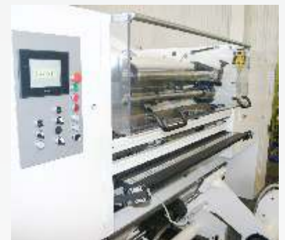
Folding splicing table